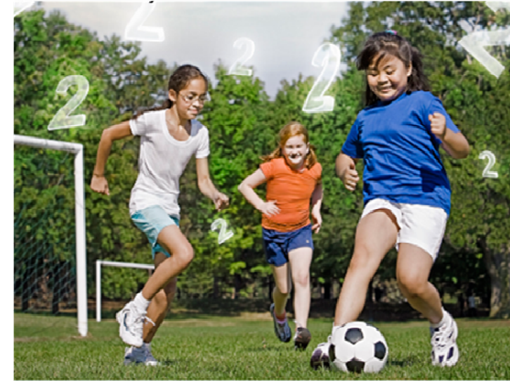
ARAGTIDA CUSUB EE HAWADA FIICAN.

Future Watch-Muscaqbalka waxa kordhaya cadadka jinsiyadaha kala duwan ee degaan guryaha qiimaha hoose waxanu wararka ku helayaan lugadaha – English, Spanish iyo Somali. Si ay u fahmaan ololaha cusub Cabbirka Tirada Hawada Fiican iyo barnaamijka cusub ee 20/20. Hawada xun ee wax u dhimaysa Caafimaadka dadweynaha, taaso muhiim u ah laalinta tamarta hawada fiican iyo caafimaadhka bulshada.